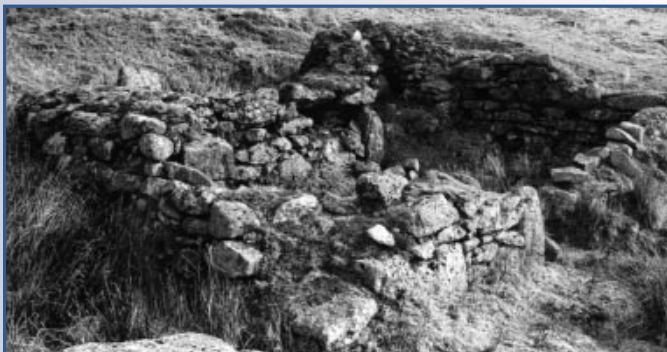
Tinners' hut

be seen the remains of the processing areas, buildings, water channels, pits and walls which give the ground a very uneven surface.