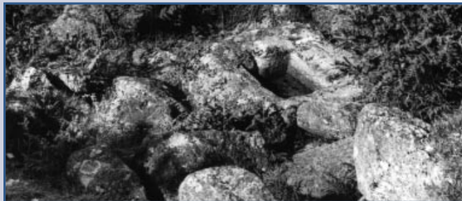
Blowing house, mouldstone and furnace

You will see the ruins of many buildings on Dartmoor. Some, like beehive huts , once used as stores or shelters, may be difficult to recognise. More often buildings are rectangular with the remains of drystone or mortared walls. Some were built and abandoned quite recently but their ruins are still important. They are associated with both industrial and agricultural activities. The ruins of blowing houses , where tin ore was crushed and smelted, may be encountered. Here may be seen the remains of the pit where a waterwheel stood, the hollowed-out granite mortarstone on which the ore was crushed, or the mouldstones for making ingots.