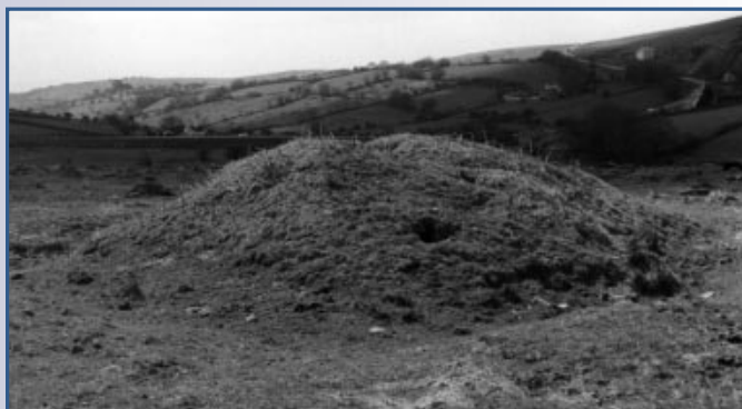
Pillow mound

From medieval times onwards rabbits were kept in warrens for their meat and fur. Pillow mounds can be found in old rabbit warrens. These are made of earth, oval or rectangular in shape, and can vary from about 5 - 30 metres in length; they were made for rabbits to burrow into. A well organised rabbit warren had vermin traps for catching stoats and weasels. These usually survive as small granite 'funnels'.