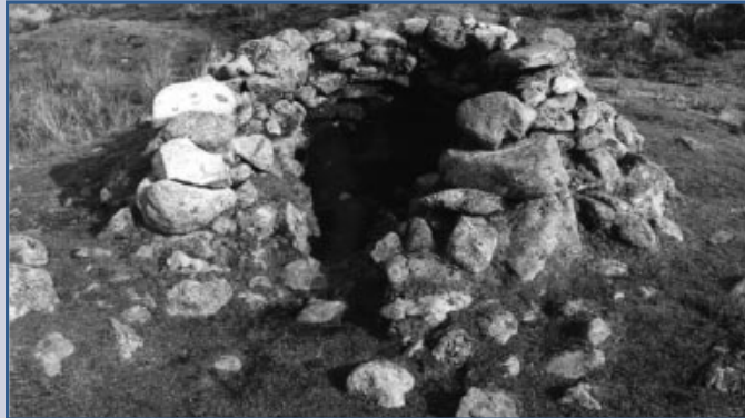
Beehive hut

At some of the later industrial sites the remains of railways or tramways may be seen. Some carried stone, tin or peat off the moor.