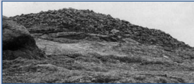
Large cairn

More difficult to recognise are ring cairns - no mound, but instead a low ring of small stones 1-2m wide enclosing a level area.