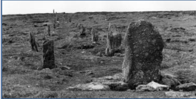
Stone row