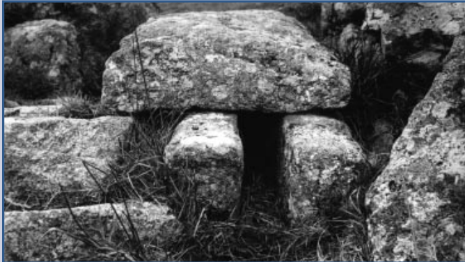
Vermin trap