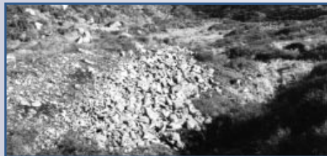
Tinners' spoil

Old industrial sites can usually be recognised by heaps of discarded stones, sometimes retained by drystone walls or arranged in long low banks. They will often be found by streams, or next to large gullies (openworks) or around mine-shafts and quarries. Near some of these sites may