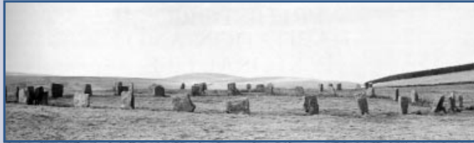
Stone circle