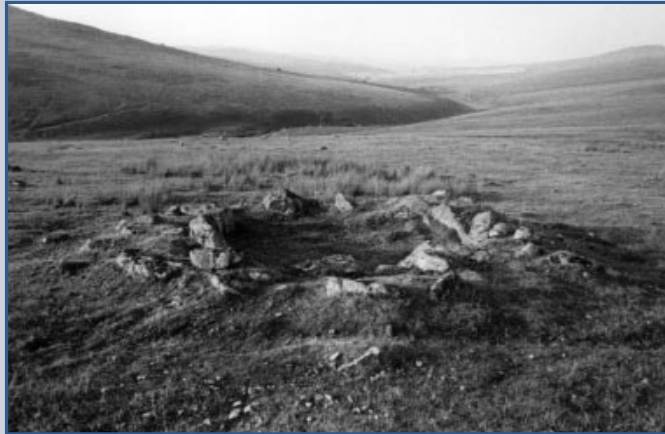
Round houses (hut circle)

Prehistoric round houses are sometimes known as hut circles. These are formed either of upright granite slabs or of 'drystone' walling, with a gap for the entrance. They can be up to 1m in height and 3-10m in diameter. Originally they had a conical roof of wood and turf or thatch.