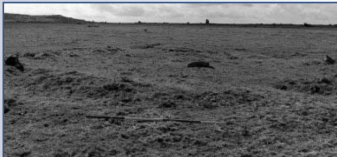
Ring cairn