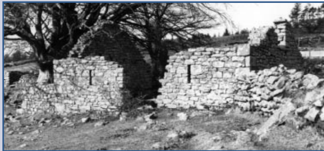
Farm building abandoned less than 100 years ago

From medieval times onwards rabbits were kept in warrens for their meat and fur. Pillow mounds can be found in old rabbit warrens. These are made of earth, oval or rectangular in shape, and can vary from about 5 - 30 metres in length; they were made for rabbits to burrow into. A well organised rabbit warren had vermin traps for catching stoats and weasels. These usually survive as small granite 'funnels'.